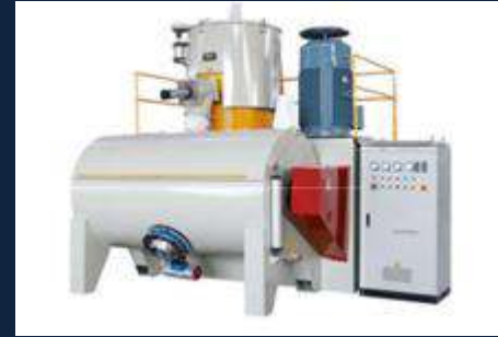
Hot Mixer Machine