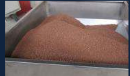
Raw Material to be Extruded