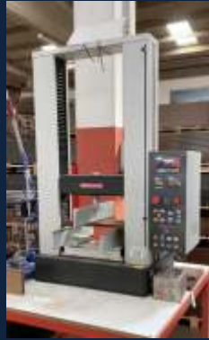
Broken Test machine