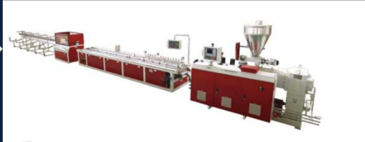
Extruder Machine + Cooling + Sizing