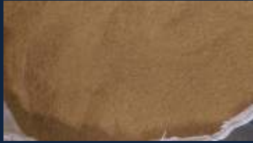
Raw Material to be Extruded