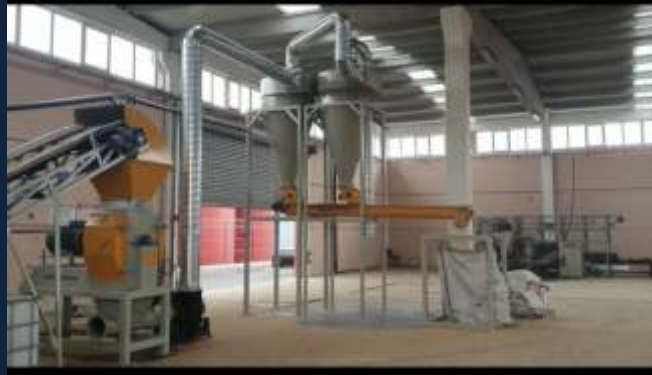
Cooling + Cutting Machine